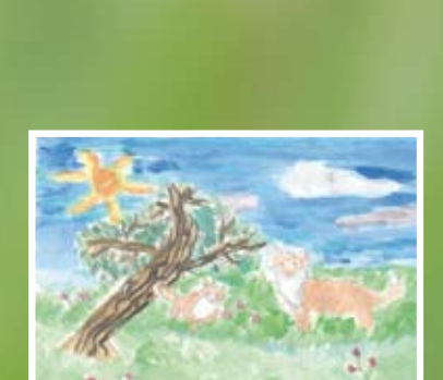
Illustrations by pupils from Emerson's Green School

local people and Mangotsfield CE Primary School. It depicts the history of the local area and features